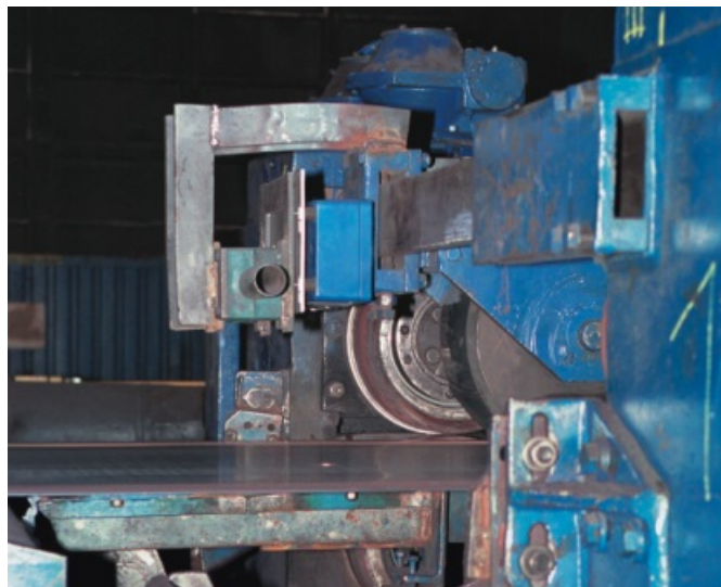
Non-contact speed measurement with the VLM 200

The plant is designed to produce widths from 550 to 1640 mm and a thickness from 1.25 to 6.35 mm. ▶