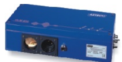
The contact-free speed measuring system VLM 200

It can happen that some of these strips come misaligned due to the coiling process. In