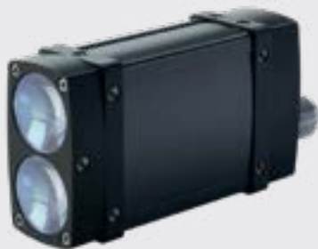
LDS70A for outdoor measurements up to 70 m

Therefore the LDS70A uses a new generation of time measurement circuit which increases the maximum measurement frequency to 40 kHz. The maximum range for measurements without reflector was extended to 70 m and the sensor firmware offers to choose between the strongest or the farthest target. This function may reduce chance for missed measurements due to influences caused by dust, fog or rain.